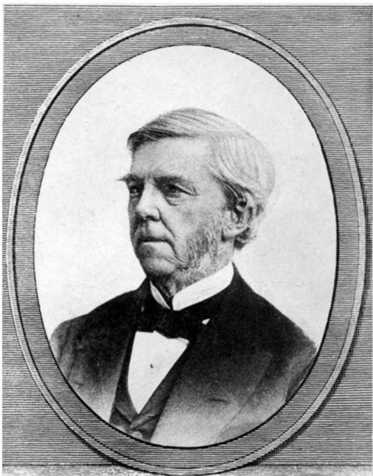
Oliver Wendell Holmes